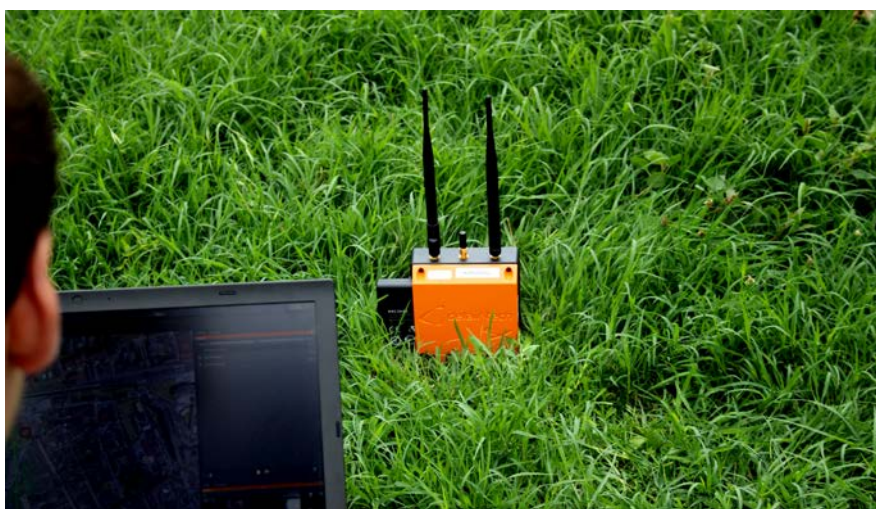
Baby Bear antenna Deployed in the field

Note: Use with Brother Bear for Video streaming